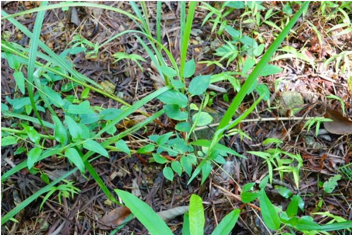
Photo 15 – Representative photo of the proposed planting species, Celtis sinensis .