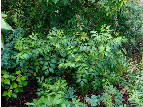
Photo 5 – Representative photo of the proposed planting species, Brucea javanica .