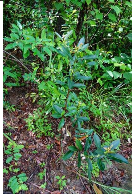
Photo 10 – Representative photo of the proposed planting species, Choerospondias axillaris .