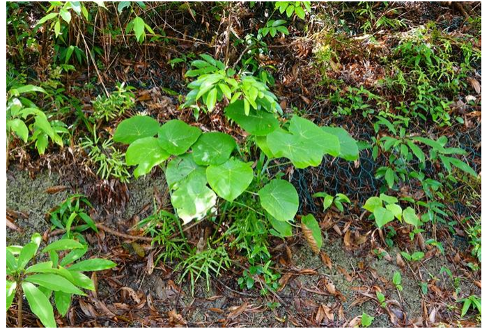
Photo 8 – Representative photo of the proposed planting species, Macaranga tanarius var. tomentosa .