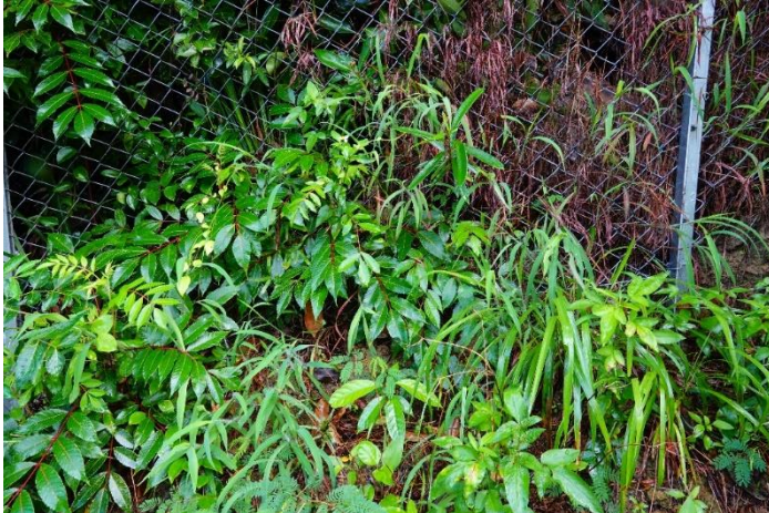
Photo 16 – Representative photo of the proposed planting species, Choerospondias axillaris .