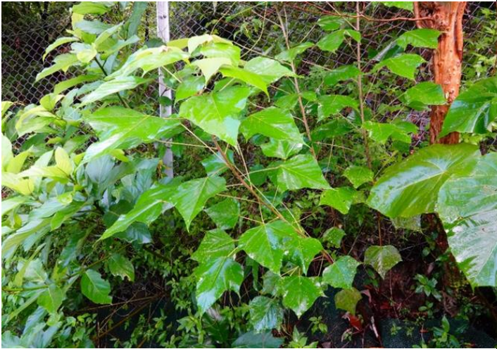
Photo 9 – Representative photo of the proposed planting species, Mallotus paniculatus .