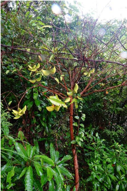
Photo 14 – Representative photo of the proposed planting species, Sterculia lanceolata in poor health condition.