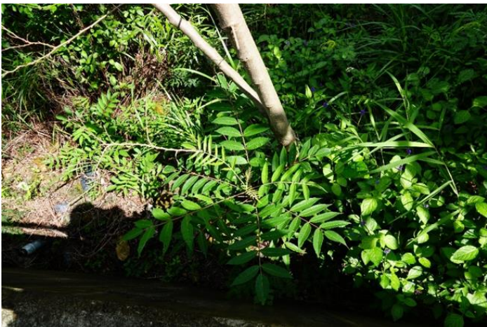
Photo 11 – Representative photo of the proposed planting species, Rhus succedanea .