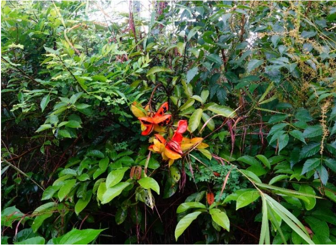
Photo 13 – Representative photo of the proposed planting species, Sterculia lanceolata .