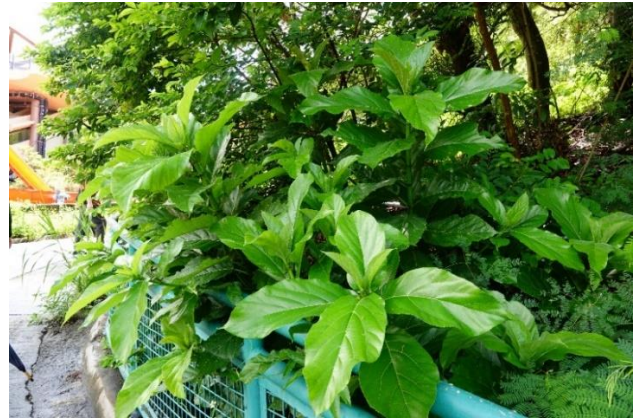
Photo 2 – Representative photo of the proposed planting species, Ficus hispida .