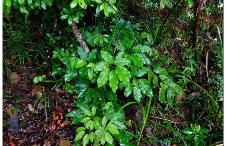
Photo 12 – Representative photo of the proposed planting species, Schefflera heptaphylla .