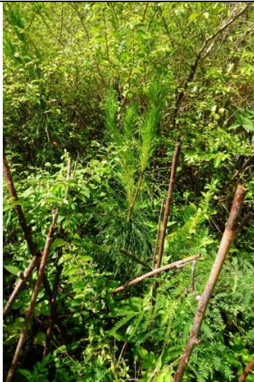
Photo 3 – Representative photo of the proposed planting, Pinus massoniana .