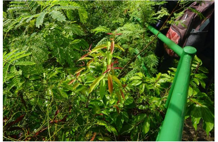
Photo 6 – Representative photo of the proposed planting species, Cratoxylum cochinchinense .