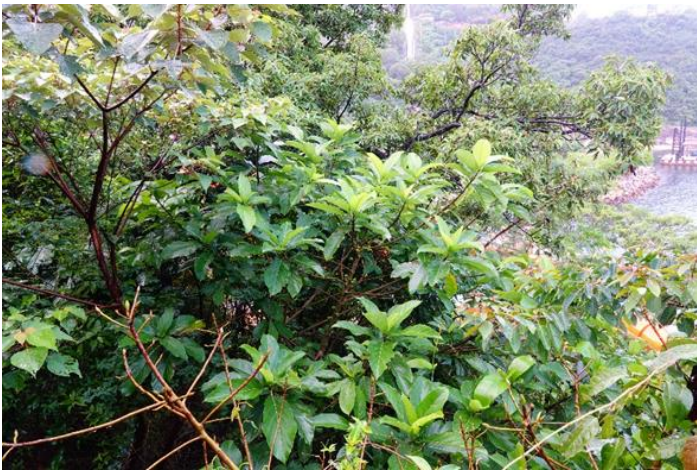
Photo 7 – Representative photo of the proposed planting species, Ficus variegata .