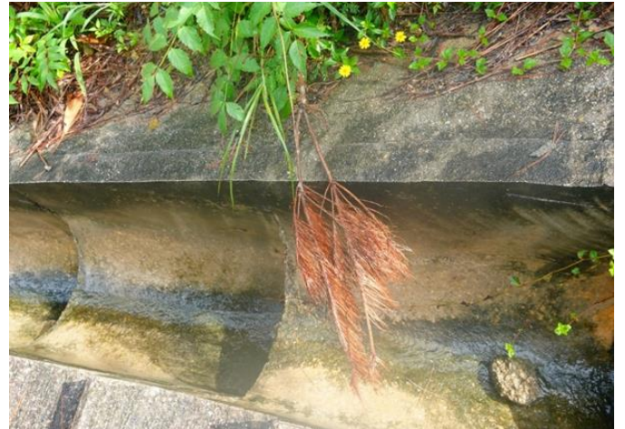
Photo 4 – Representative photo of the proposed planting, Pinus massoniana observed to be dead.